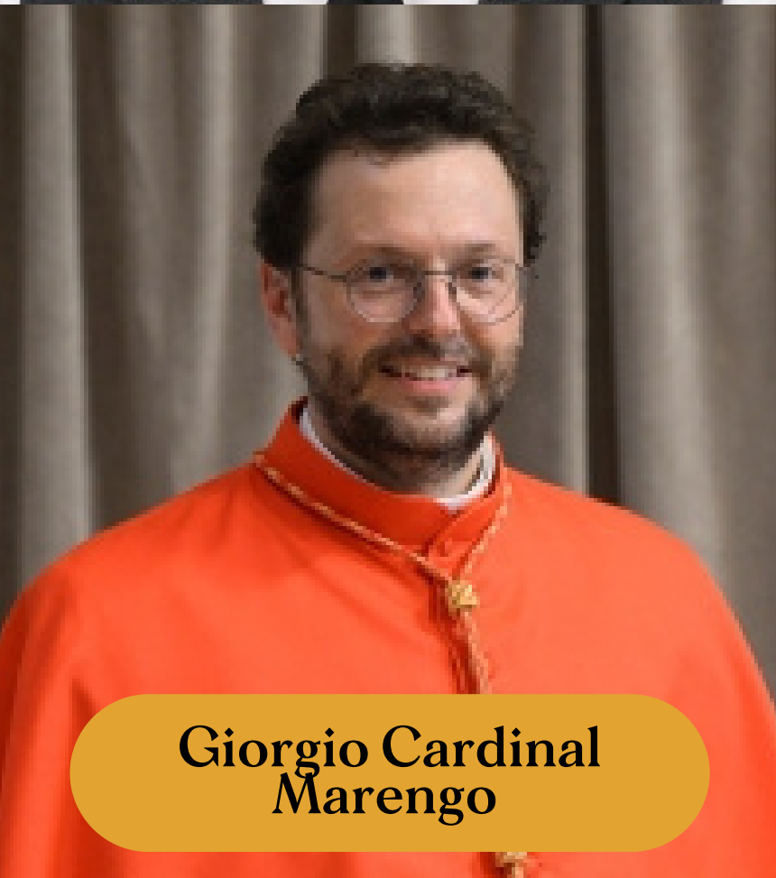
Giorgio Cardinal Marengo